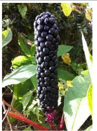
Inkweed berries (15cm)

We need your help to look out for this weed on King Island. The more people who can identify it and let us know where they see it, and/or control it themselves, the more hope we will have of stopping it from taking over!