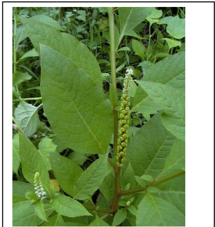
Leaves (20cm) and buds (15cm)