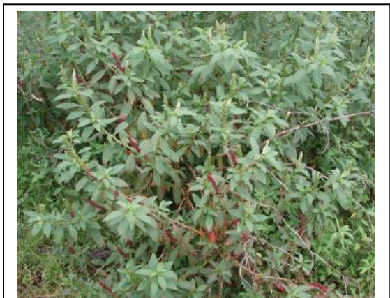
Inkweed plant (2 metres)

King Island is the only location that Inkweed is known in Tasmania.